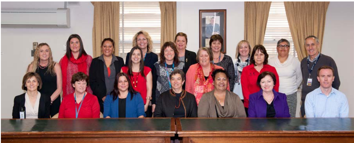
Aboriginal Health Steering Committee

WCHN is highly regarded for its leadership in Aboriginal Health, both internally and across SA Health and externally, notably for its establishment of the Aboriginal Health Steering Committee. WCHN is the only Local Health Network to have embedded an Aboriginal Health Committee, chaired by the Chief Executive Officer and comprising all Senior Aboriginal Leadership Group members. This committee reports to WCHN Strategic Executive and assists WCHN fulfil its key role of corporate and clinical governance.