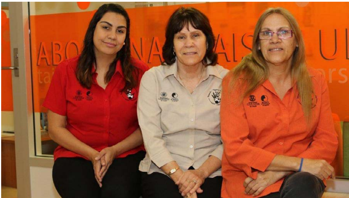
Aboriginal Liaison Unit Staff

If you would like to receive updates on the development of the new WCHN Aboriginal Health Plan and/or be involved in future consultations, please contact the WCHN Aboriginal Health Division on 8303 1674 or email newAHPfeedback@sa.gov.au