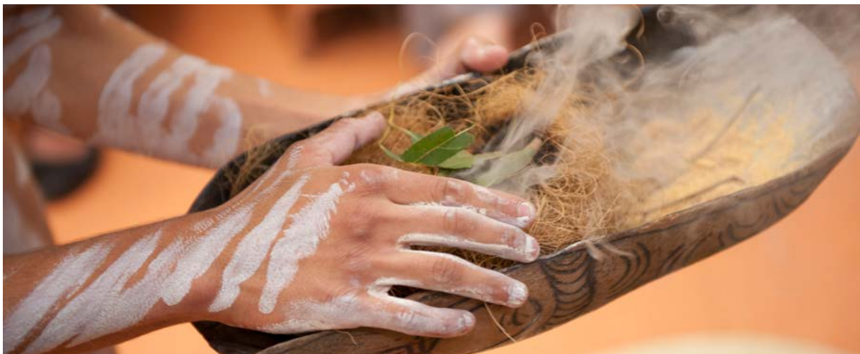
Aboriginal Liason Unit Smoking Ceremony

We are committed to working with Aboriginal communities to strengthen a relationship of mutual trust and respect.