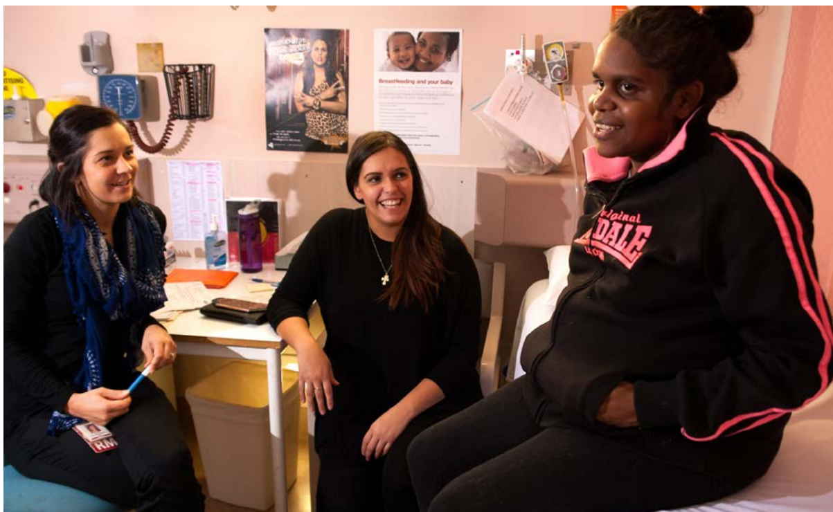
Aboriginal Family Birthing program midwife with an AMIC worker and Aboriginal consumer