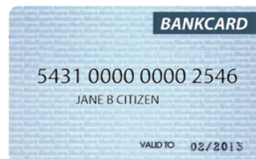
☐ Bank Card/ Bank Book