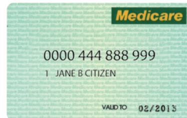
☐ Medicare Card