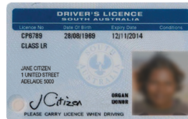
☐ Photo ID