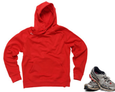
☐ Warm clothes and shoes