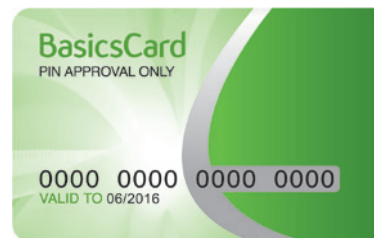
☐ Basics Card