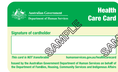
☐ Health Care Card/ Pensioner Concession Card